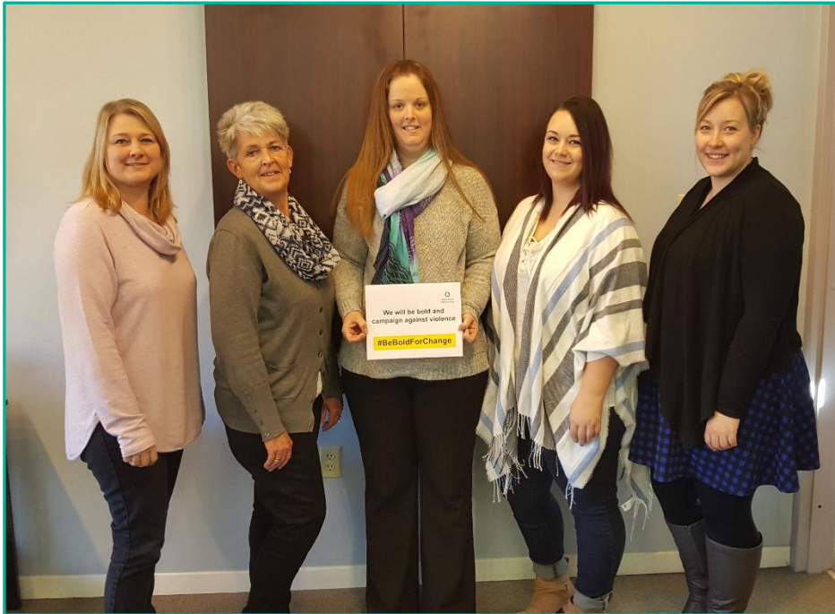
March 8, 2017 – The staff celebrate International Women’s Day

On March 8, 2017 we celebrated International Women’s Day by connecting with our close community partners. We presented them with a $5 gift card and encouraged them to recognize the significance of that money value. Information sharing about the $5 representing at least four days of hard work for women in developing countries led to conversations allowing us to join our community partners in recognizing International Women’s Day.